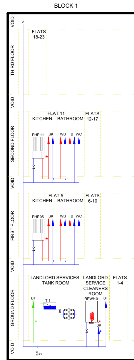
MCWS 1 (LANDLORD SERVICES TANK ROOM)